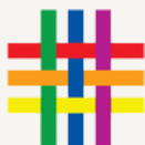
Brooklyn Community Pride Center

RUSA LGBTQ+ is extremely grateful for in-kind donations of meeting space, supplies, clothes, furniture, and services by: